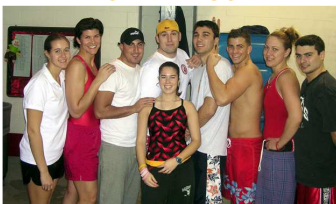
The MAP Team

The MAP is well known in the surrounding communities as an effective instructional program for the individuals with disabilities. This year's APE students are part of successful and effective program which has been in operation for the past 25 years. As interns they are expected to maintain the positive reputation of the program and continue to display the enthusiasm, creativity and commitment to quality programming which has been the trade mark of our students for the past 25 years.